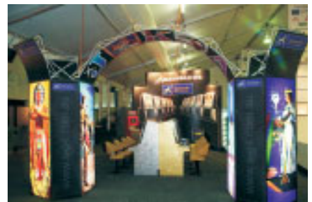
top: Cold Power middle: Ainsworth Gaming Technology bottom: NSW Fisheries