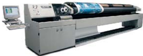
The new generation

of Solvent HiRes Inkjet Printers enables us to produce almost photographic quality direct to vinyls, papers and backlit films.