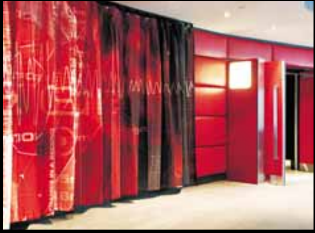
DIGITAL CANVASES: Jaguar Stand (Design by Designtroupe; Production by Flash Photobition)